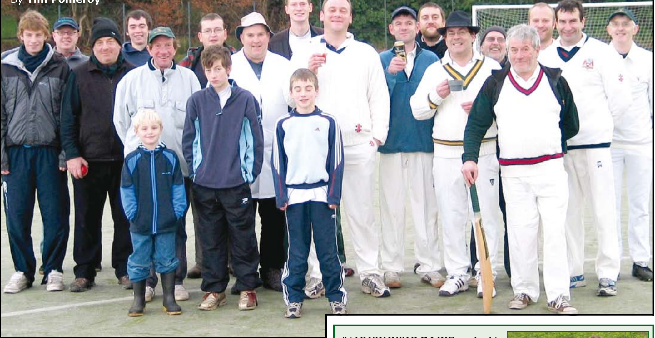
Some very hardy souls turned out for the New Year's match last January