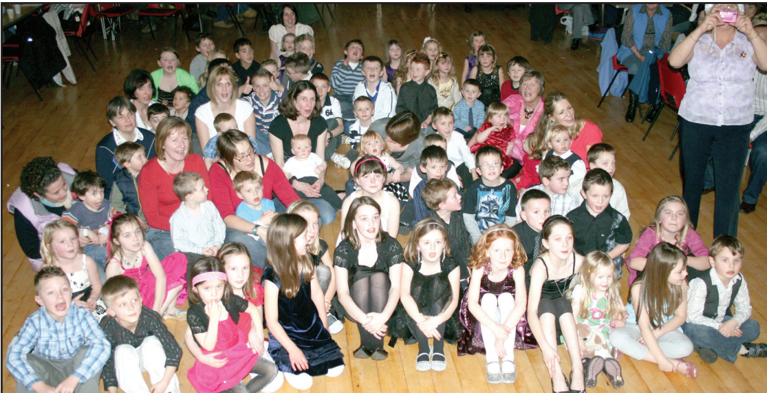
The next generation. Shiskine Village Hall's Christmas party was as well-attended as ever