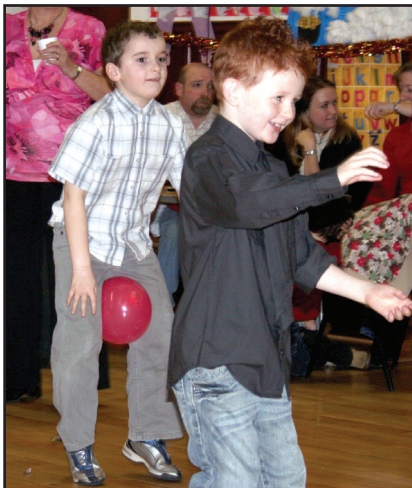
Nice and knees! Youngsters in a balloon race