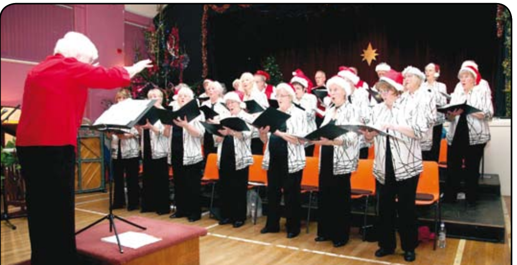
The Rowan Singers have been keeping their vocal chords in beautiful working order this Christmas and sang to a thrilled audience last weekend in Brodick Village Hall.