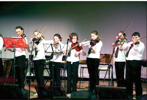
Strings group, High School concert