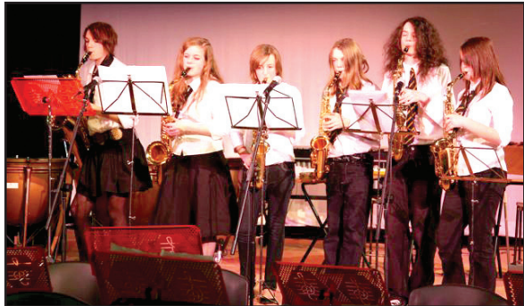
The sax group from the High School concert.