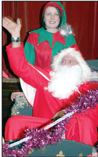
Santa waves goodbye before continuing his long journey