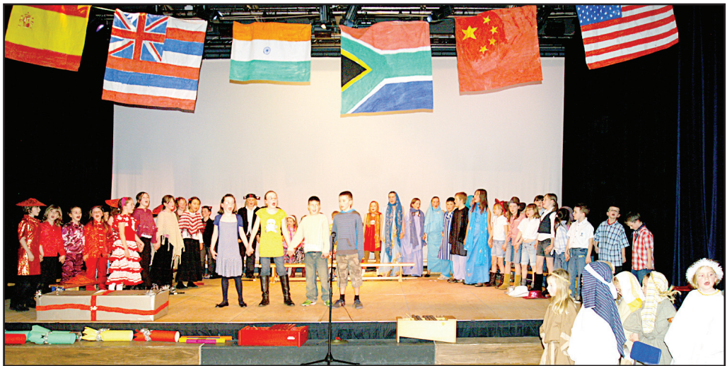
The full ensemble singing the last song